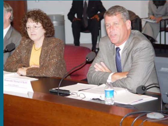
November 2005 – First Summit