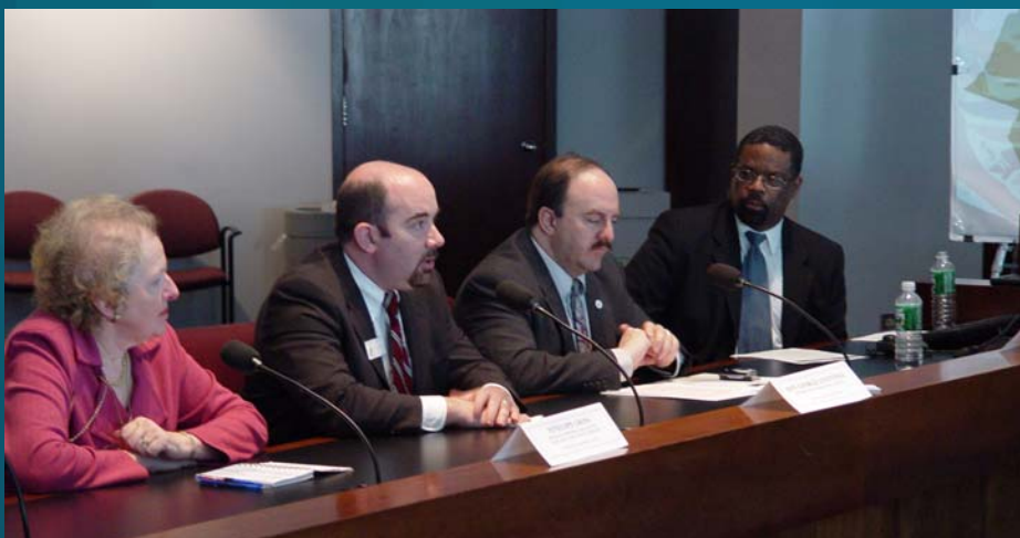
March 2006 – Second Summit