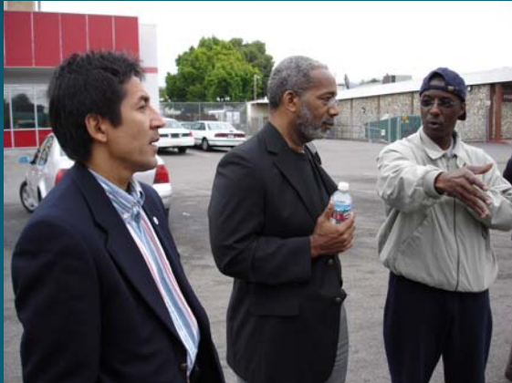
June 2005 - Oakland Site Visit