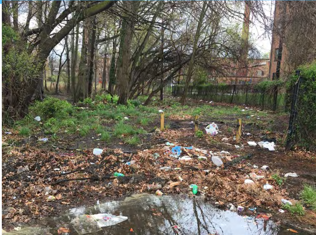
Quarles St NE (near Kenilworth Aquatic Gardens)