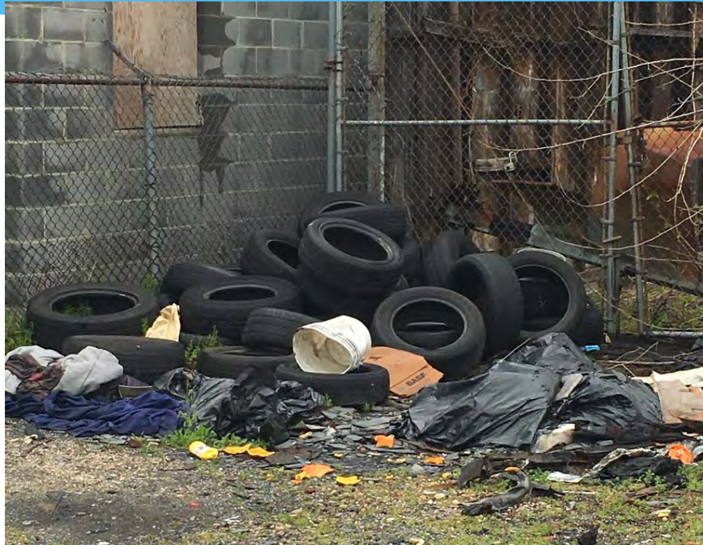
Alley Near the 4600 Block of Minnesota Ave NE