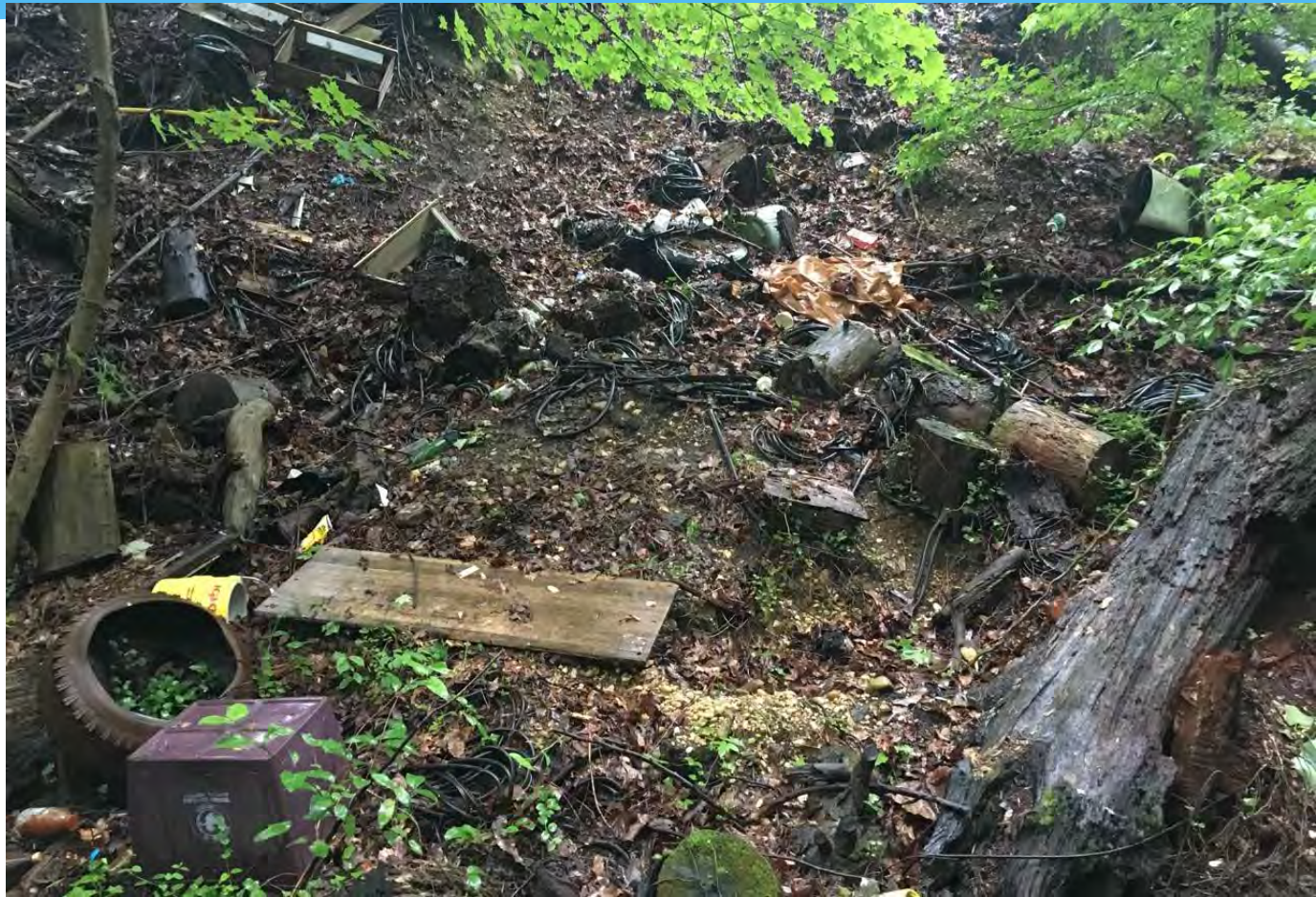
Fort Dupont Park