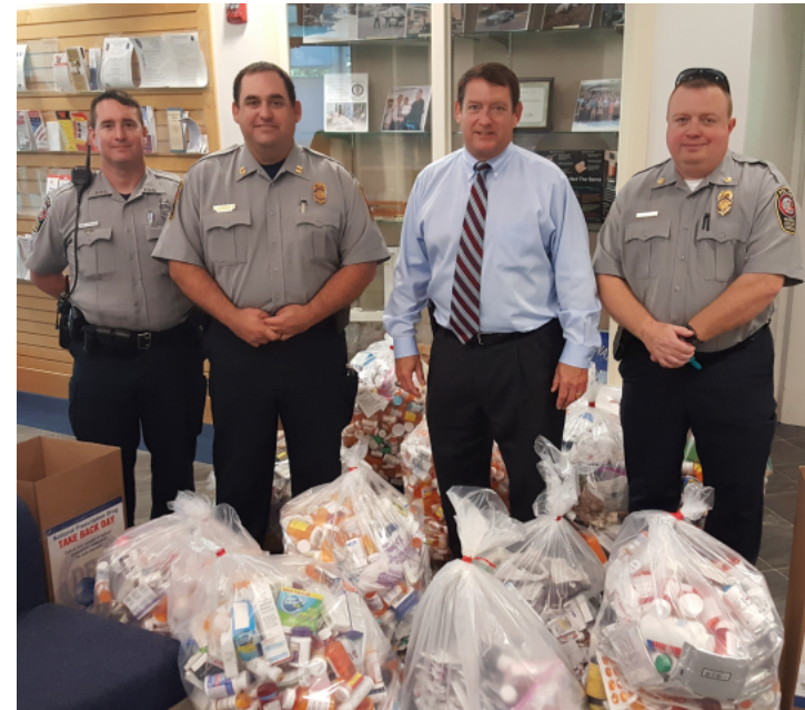
Fairfax County Drug Take Back, October 2017