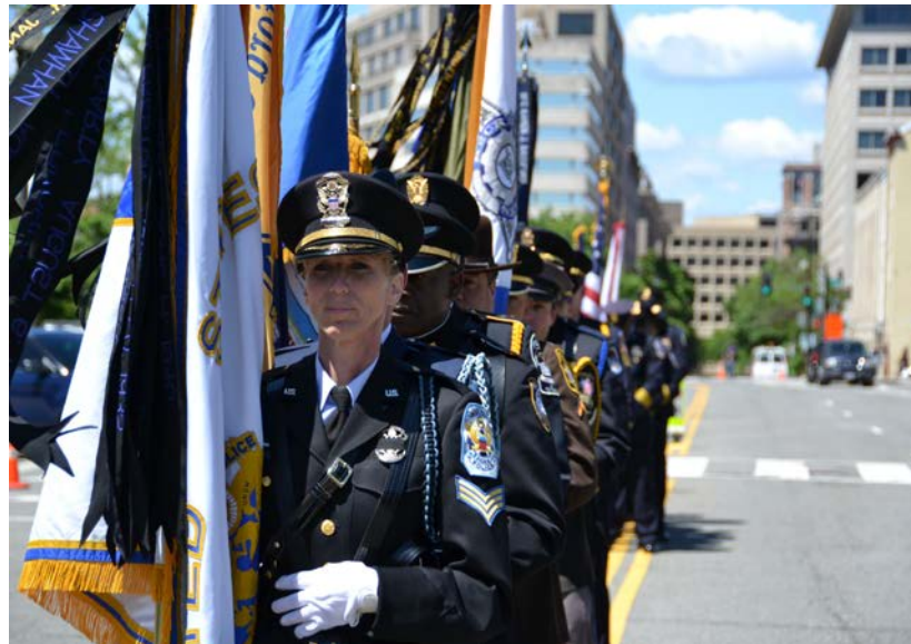
Metropolitan PD Honor Guard, 2017 Police Week