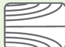
Capital District Transportation Committee