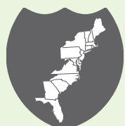
I-95 Corridor Coalition Beyond Boundaries

This helps maintain a constant speed and improves fuel economy up to 7%.