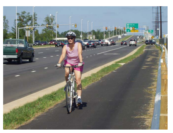
Figure 3: Side Path on Fairfax County Parkway

but are closely adjacent to a non-limited access roadway and thus subject to more frequent conflict