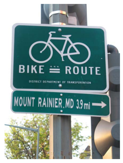
Figure 6: DC Bike Route Sign

The region has hundreds of miles of signed bicycle routes. Signed routes have the advantage of being inexpensive and informative for cyclists. A signed route has not necessarily had any bicycle-related improvements apart from signing. However, bicycle-friendly features such as paved shoulders, a wide curb lane, or low traffic volumes or speeds may be present. The trend with bicycle route signs is to include information on distances to destinations.