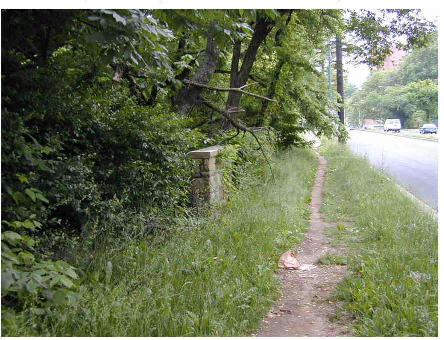
Figure 1: Informal foot path

The Washington region has excellent long-distance separated facilities for bicyclists and pedestrians, and an urban core and certain regional activity centers that have good pedestrian and bicycle facilities. On the other hand, many activity centers, not originally designed with pedestrians in mind, have grown dense enough to generate significant