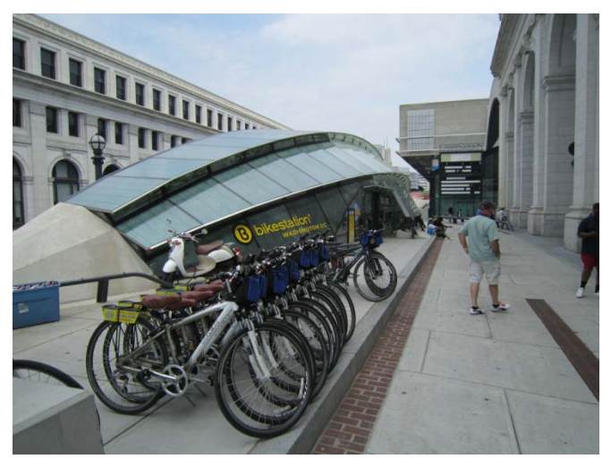
Figure 8: DC Bike Station at Union Station