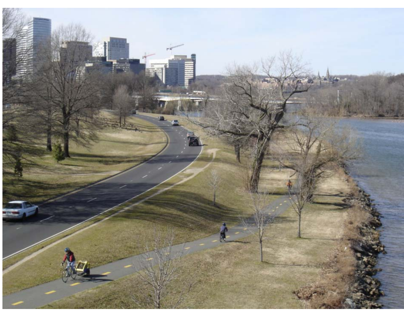
Figure 2: Mount Vernon Trail

The Washington region is renowned for the quality and extent of its major shared-use paths. Shared-use paths are typically located in their own right-of-way, such as a canal, railway, or stream valley, or in the right-of-way of a limited-access highway or parkway, such as the George Washington Memorial Shared-use paths Parkway. are eight to twelve feet in width. The region has approximately 200 miles of major shared-use paths, either paved or level packed gravel surface suitable for road