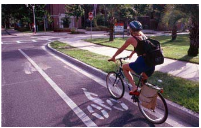
Figure 4: Bicycle Lane

Bicycle lanes are marked lanes in the public right-of-way that are by law exclusively or preferentially for use by bicyclists. Bike lanes are one-way, with a bicycle symbol or arrow indicating the correct direction of travel. The minimum width next to a curb is 4 feet for roadways with no curb or gutter, next to a curb or parked cars 5 feet. Bike lanes are provided on both sides of the street, except for one-way streets, and allow travel only