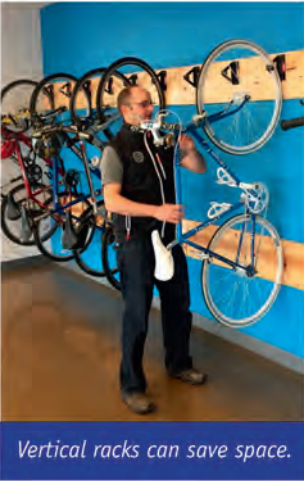
Vertical racks can save space.