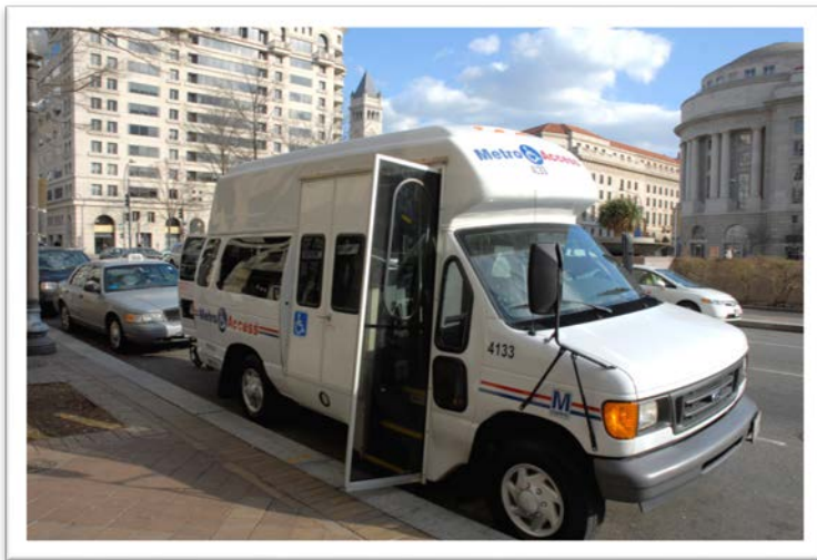
Old “Cutaway” Vehicles