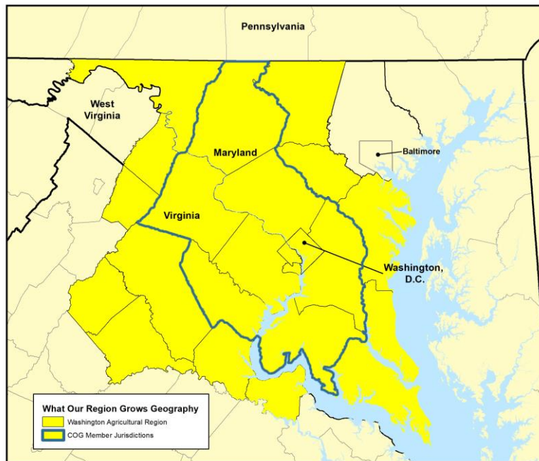
Figure 2. Washington Agricultural Region

The equine, horticulture, and landscaping industries are also integral parts of the region's agricultural economy. These use some of the same support services as farmers and ranchers growing and raising food for animals and people, such as large animal veterinarians and farm supply stores.