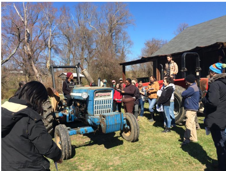
Future Harvest CASA 2018 Beginning Farmer Field Day

These challenges make farming a low-margin and risky business. In fact, the average net farm income in the region was $2,676 in 2012. As a result, many farmers have a second job as their primary source of income; in the Washington Ag Region, 63% of all farmers also work off-farm.