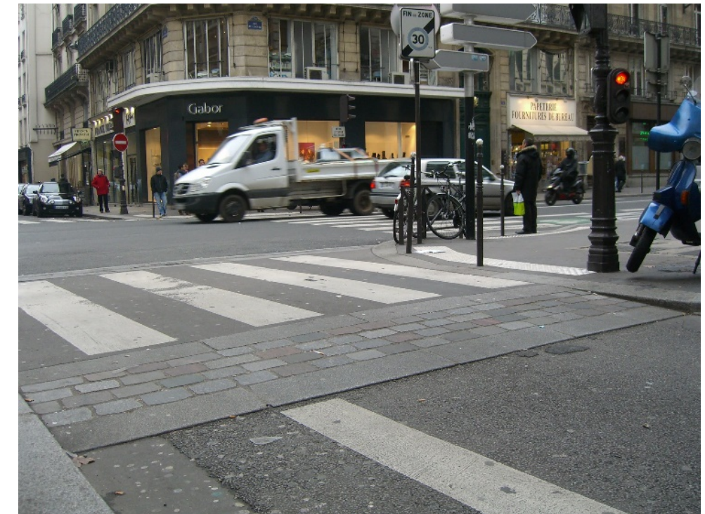
A raised crossing at sidewalk-level across a low-speed, low-volume street.

B-3d: Provide marked crosswalks and Accessible Pedestrian Signals (APS) at all legs of an intersection where there are connecting sidewalks or comfortable streets.