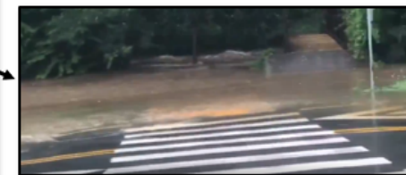
Sligo Creek and Brunett Avenue, Silver Spring, Montgomery County.

(Not all damage is captured here, nor confirmed. Sources: media, emergency management, highway department, and the public)