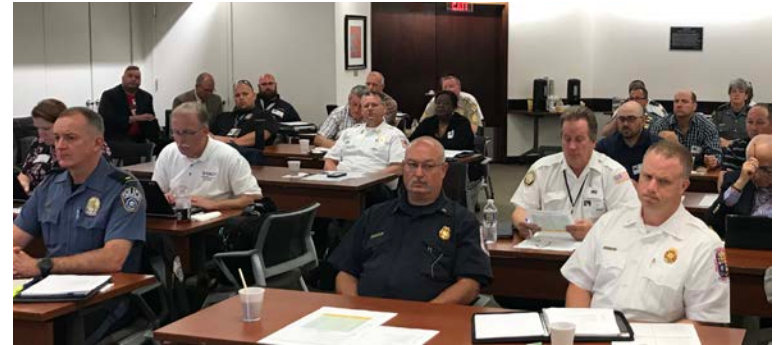
May 22 Regional TIME Workshop (COG)