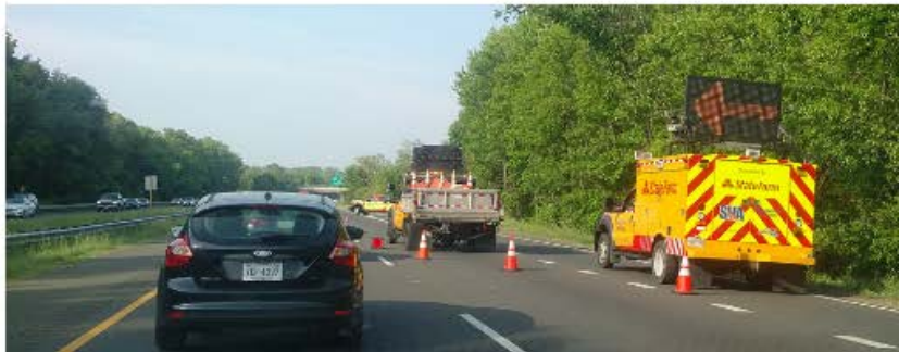
Motorcade in DC (Mack Male/ Flickr ); 395 South (sabreguy/ Flickr ); (Patrick Zilliacus/COG)