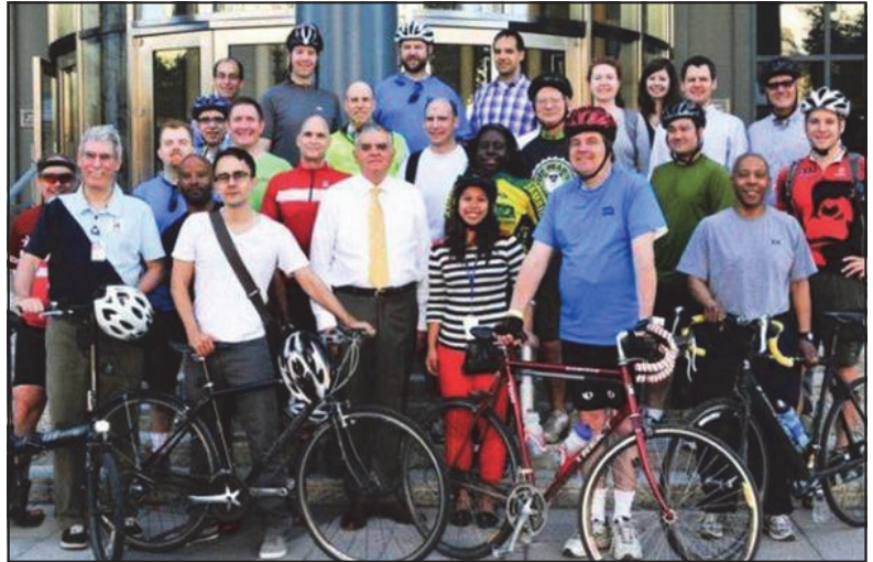
US DOT Secretary Ray LaHood (center, with tie) attended the Bike to Work Day pit stop at the US DOT building in the District and advertised the event on his blog and Facebook page.

Bike to Work Day sponsorship reached a record-breaking cash total of $48,550, a 6.5 percent increase over 2012. In addition, in-kind sponsorships of $17,450 exceeded last year's total by 13 percent.