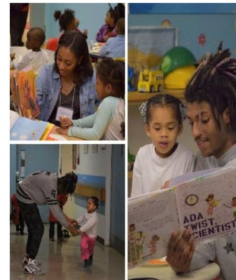
(Homeless Children's Playtime Project)

Children represent 60% of all people in homeless families