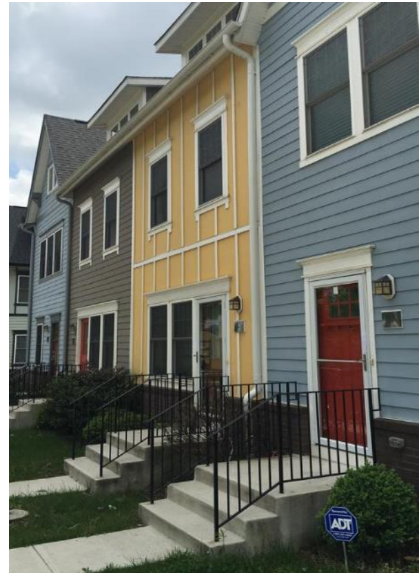
Eden Place at Beulah Crossing