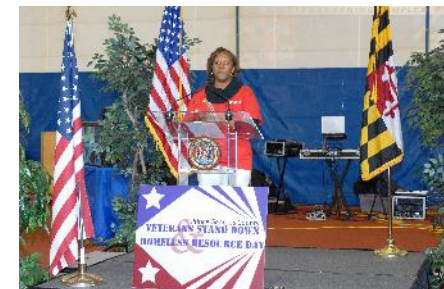
(Maryland GovPics Veterans Stand Down & Homeless Services Day, Prince George's County, 2011)