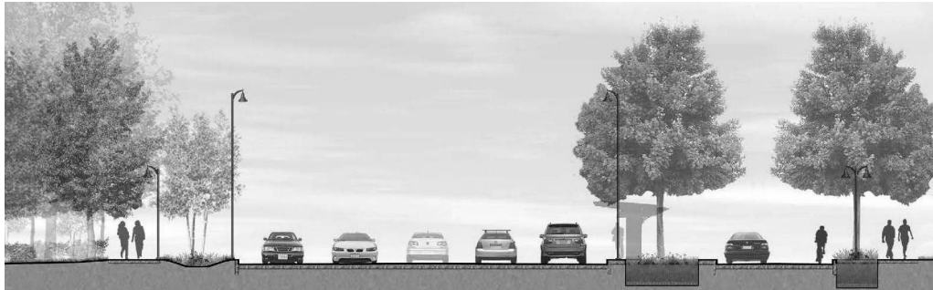
Rendering of New Hampshire Ave for a 2012 TLC project in Takoma Park, Maryland.

The kinds of improvements being studied with funding under the TLC Program are a cornerstone of the Regional