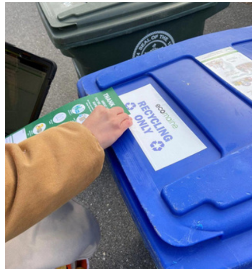
Curbside Inspection & Tagging