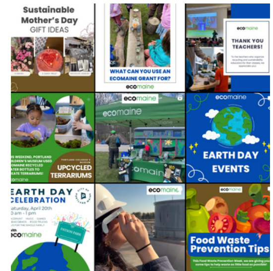
Digital and Social Media