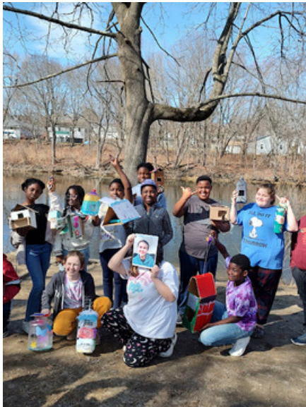
Community Events & Schools

Our Communications and Education team aims to reach residents throughout our 73+ member communities to encourage them to practice the 3Rs: reduce, reuse, THEN recycle!