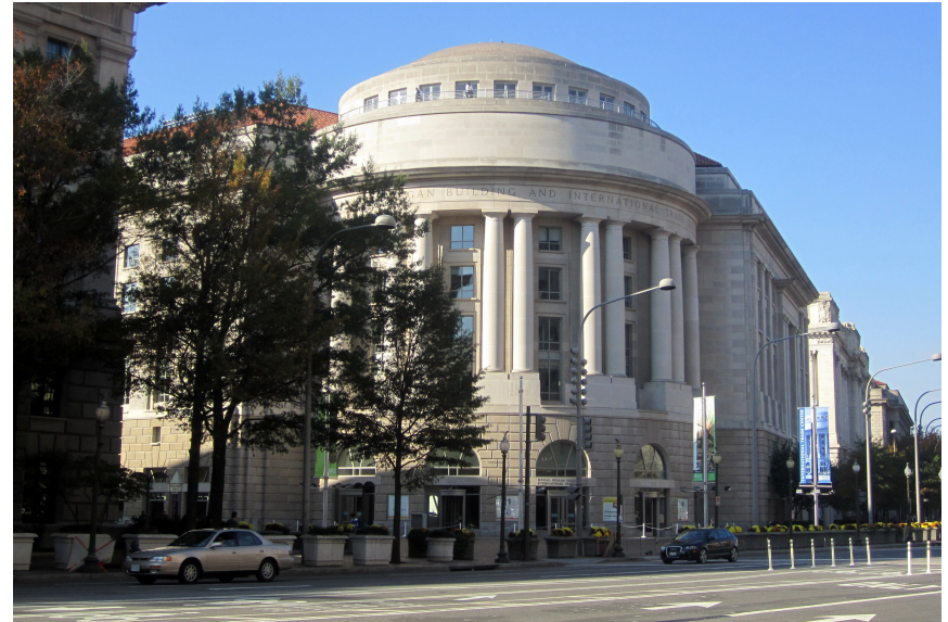
Ronald Reagan Building