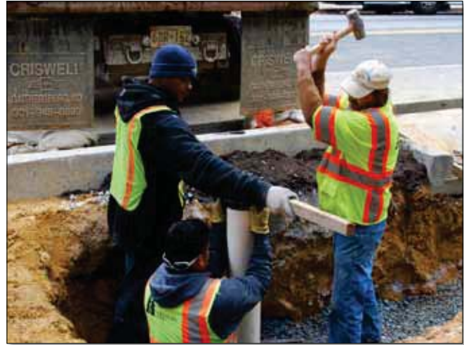
Workers build a stormwater pollution control device called a “bumpout” in Montgomery County, Maryland.

The workers are building a stormwater pollution-control device called a “bump out.” It’s a new technique—a grassy area built by the side of the road, with openings at either end to catch and filter rainwater as it flows down the gutter.