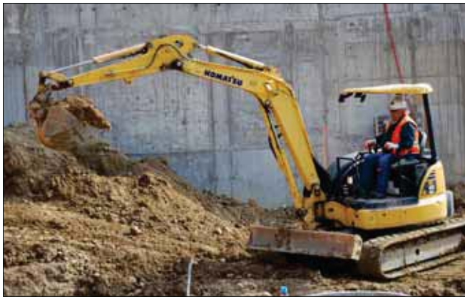
Construction crews are working to improve sewage treatment plants across the Chesapeake Bay region.