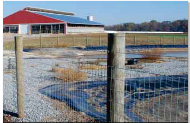
Dairy farmer Leroy Walker built these two manure pits and this new barn to reduce runoff pollution into a nearby stream, which flows toward the Chesapeake Bay.

Walker's construction project included a pair of plastic-lined manure storage pits, a shed to keep rain off his feedlot, and an expanded, state-of-the-art barn with good ventilation and drainage.