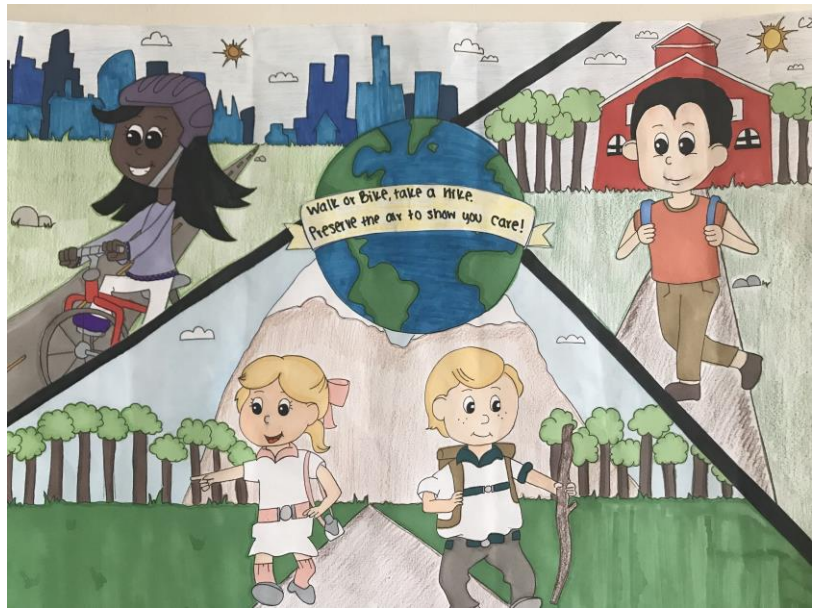
First Place: Claudia Colon-Del Valle