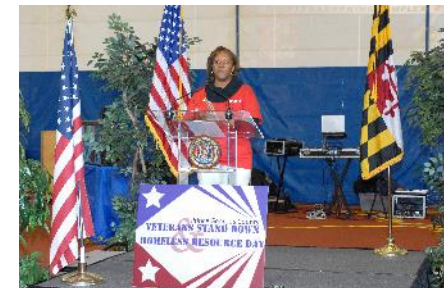
(Maryland GovPics Veterans Stand Down & Homeless Services Day, Prince George's County, 2011)