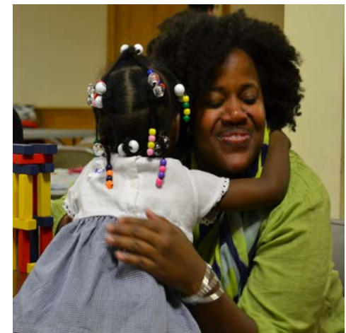
(Homeless Children's Playtime Project)

Children represent 62% of all people in homeless families