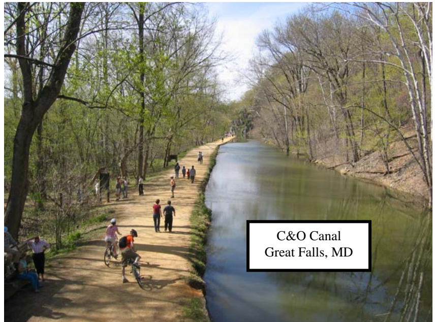
C&O Canal Great Falls, MD

Priorities 2000: Metropolitan Washington Greenways, and Priorities 2000: Metropolitan Washington Circulation Systems. The Greenways report supports the greenways and trails component of the TPB vision, while the Circulation Systems report supports the goal of improving circulation, especially non-motorized circulation, within the urban core and the regional activity centers.