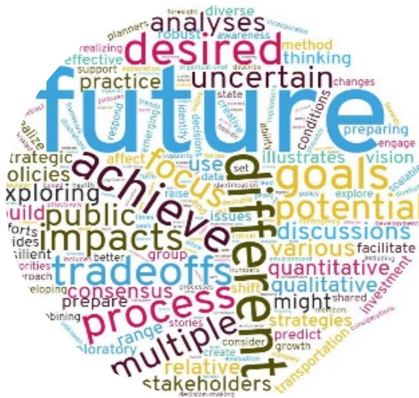
Word Cloud Source: Responses from Study Oversight Committee Members to a questionnaire about their definition of scenario planning. June 2020.

Preparing for a Desired Future Scenario planning shifts the focus away from reacting to a predicted future and toward preparing for a desired future. The story-like quality of scenarios makes it easy for the public to participate in discussions about costs, benefits, and priorities, while the quantitative rigor of the analysis enables agencies to incorporate results into technically robust, resilient plans with complementary—not conflicting—goals and strategies. In times of crisis, scenario planning can help planners let the public know that thoughtful leaders are thinking about the future and the world is not simply out of control; it can inspire hope and confidence among participants that, although they may not have all the answers, they can act positively to manage the forces of change. These characteristics of scenario planning make it a powerful tool for agencies committed to providing infrastructure and services that will meet communities' needs now and for decades into the future.