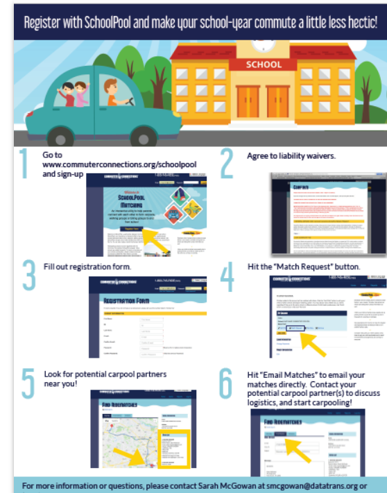
How to register