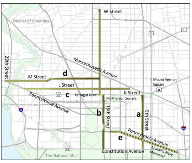
The DC Bike Lane Pilot Project, shown above, will add barrier-protected bike lanes on five streets in Downtown DC.

The only new regionally significant projects have been submitted by the District