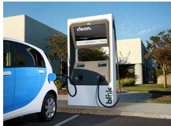
Figure 4 ECOTality DC Fast Charger

The DC Fast Charger (also designated DC Level 2) is designed to return a significant recharge to the EV in a short period of time. Thus it is expected that an EV will remain connected to this DC Fast Charger for a short time, similar to that involved in refueling an internal combustion car. To accomplish this, the equipment is designed to provide the high current necessary. The weight of the DC Fast Charger connector and cable is the biggest impediment to full, unassisted access of to the DC Fast Charging station.