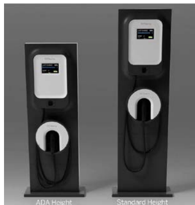
Figure 3 ECotality Level 2 EVSE

ECotality provides for accessibility in the Level 2 EVSE by adjusting the height of the unit.