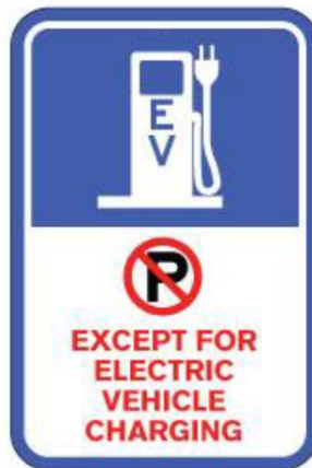
Figure 2 EV Charging Only Sign

Establishing an EV charging infrastructure has unique challenges in that the public is not used to seeing EVSEs in public and may be unfamiliar with its purpose and use. Without specific signage to the contrary, internal combustion engine vehicles may park in spaces equipped with an EVSE because they are convenient and vacant. When an EV arrives, the driver finds the space occupied and is unable to connect. For that reason, it is recommended that municipalities adopt specific ordinances to prohibit non-EVs from parking in spaces marked for "EV Charging Only" and require that EVs parked in spaces marked for "EV Charging Only" be connected to the EVSE while parked.