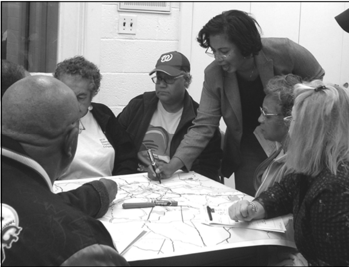
On October 29, residents in Ward 7 decide where they believe transportation infrastructure is needed to accommodate forecasted employment and household growth.

In recent weeks, TPB staff has conducted outreach forums in the District of Columbia with the DC Federation of Citizens Association and residents of Ward 7. The forums are part of a series called "What If the Washington Region Grew Differently?" They provide information on the TPB's transportation and land-use scenario study, the Regional Mobility and Accessibility Scenario Study. TPB staff will report feedback provided at the District forums to the TPB Scenario Study Task Force to help shape future scenario planning activities and other TPB actions that may be appropriate. ▲