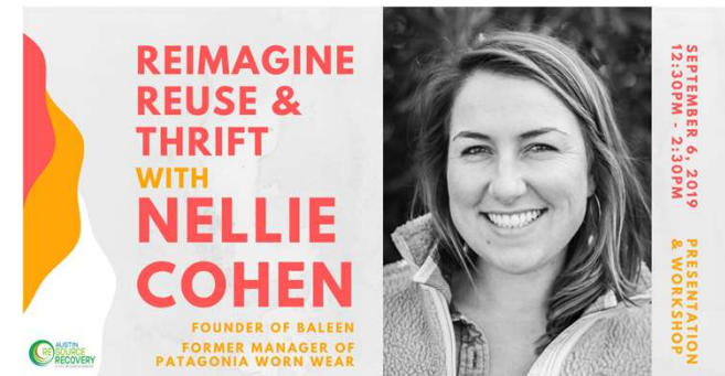
Educational Events, Business Assistance & Networking