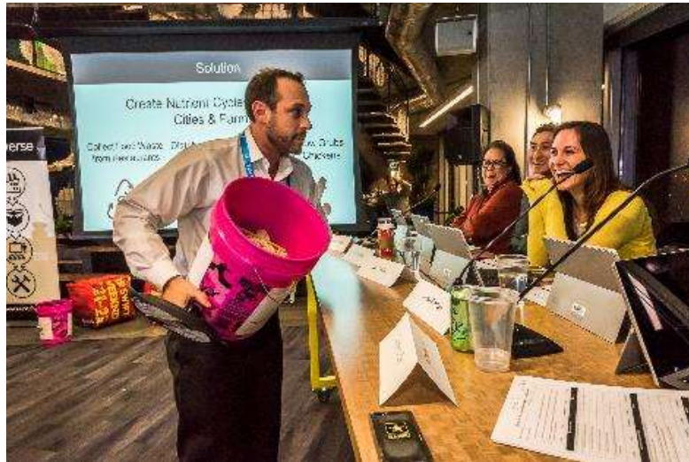
Reverse Pitch Competition