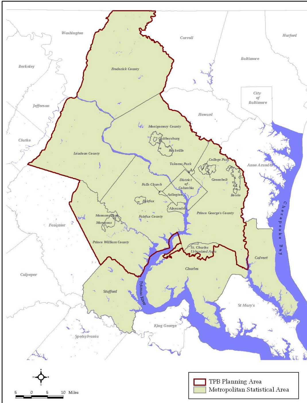
Figure i-1 TPB Planning Area, Washington DC-MD-VA Metropolitan Statistical Area (MSA)