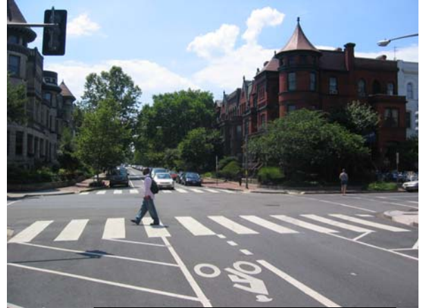
The Urban Core has well-developed facilities for Walking and Bicycling

The National Capital Region Transportation Planning Board has long recognized the benefits of bicycling and walking in the region’s multi-modal transportation system. The Transportation Planning Board’s Transportation Vision for the 21 st Century , adopted in 1998, emphasizes bicycles and pedestrians in its goals, objectives and strategies. A key part of the vision is a strong urban core and a set of regional activity centers, which will provide for mixed uses in a walkable environment and reduced reliance on the automobile. The Vision also calls for the implementation of a regional bicycle and pedestrian plan. The policy recommendations and projects in this plan, if implemented, will help realize the Vision.