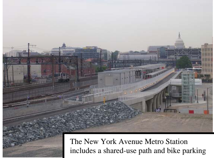
The New York Avenue Metro Station includes a shared-use path and bike parking

Bicycling and walking have yet to reach their full potential in the Washington region, however. Many trips currently taken by automobile could potentially be taken by bicycle. The average work trip length for all modes in the Washington Metropolitan Statistical Area is 16.2 miles. 1 But 17% of commute trips are less than five miles, a distance easily covered by bicycle for most people. The average trip distance to transit or carpool is only 3.1 miles. 2 Bicycling or walking to transit would allow many people commuting longer distances to avoid driving.