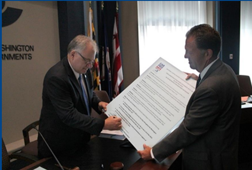
2013 TPB Proclamation Signing