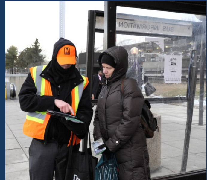
Photo of a Metro employee talking to a customer at a station pop-up event