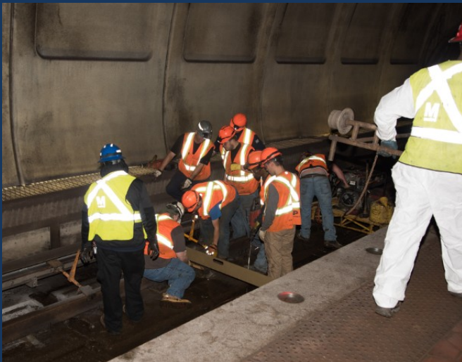
Photo of Trackwork at the Bethesda Station