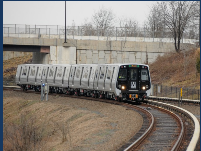
Photo of 7000 series train on outdoor track