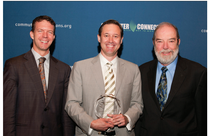
At the 17th Annual Commuter Connections Employer Recognition Awards, winners are honored for their efforts in reducing carbon footprints and regional traffic congestion by offering innovative transportation-benefits packages to employees

The Committee reviewed a draft of the 2013 Report on Crime and Crime Control, which provides information to governmental officials and the public as to the nature of the crime problem in the region. It also provides law enforcement administrators with criminal statistics.