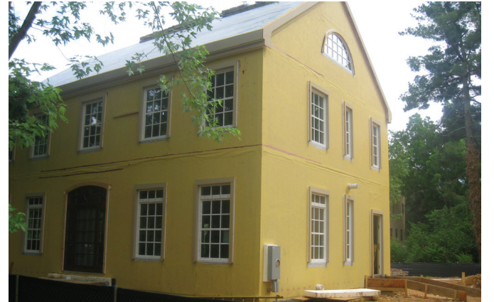
A super energy efficient "passive house" in Rockville, MD that uses 80% less energy than traditional homes