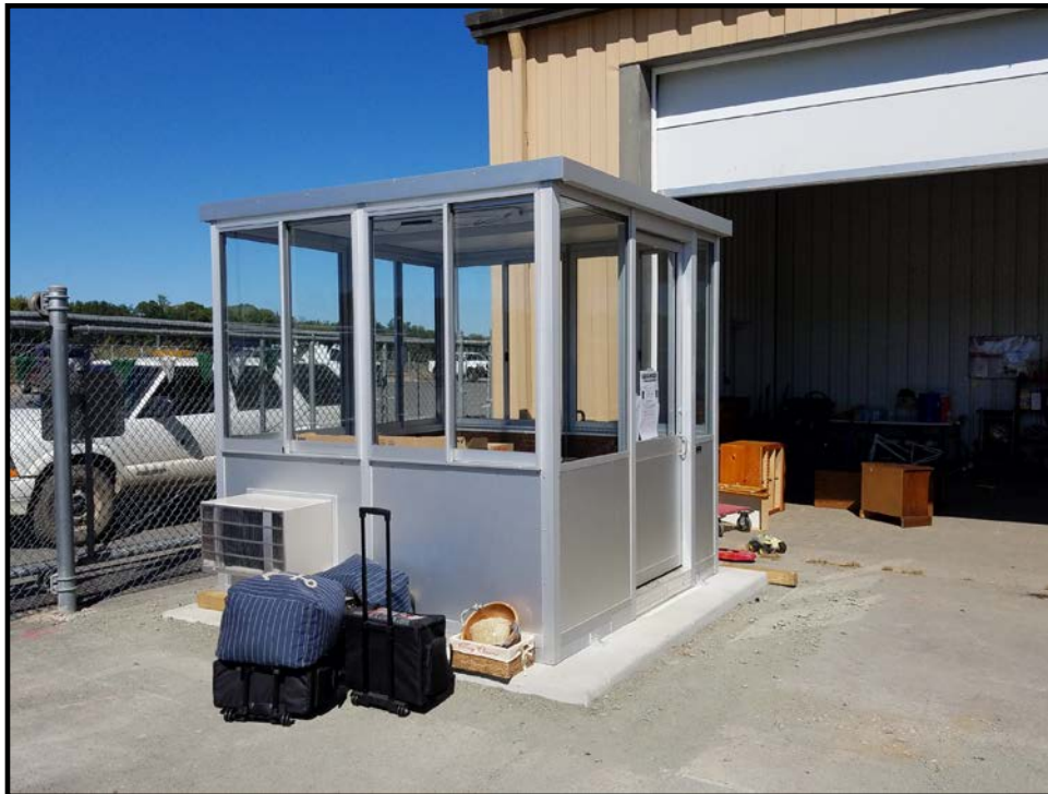
New attendant booth