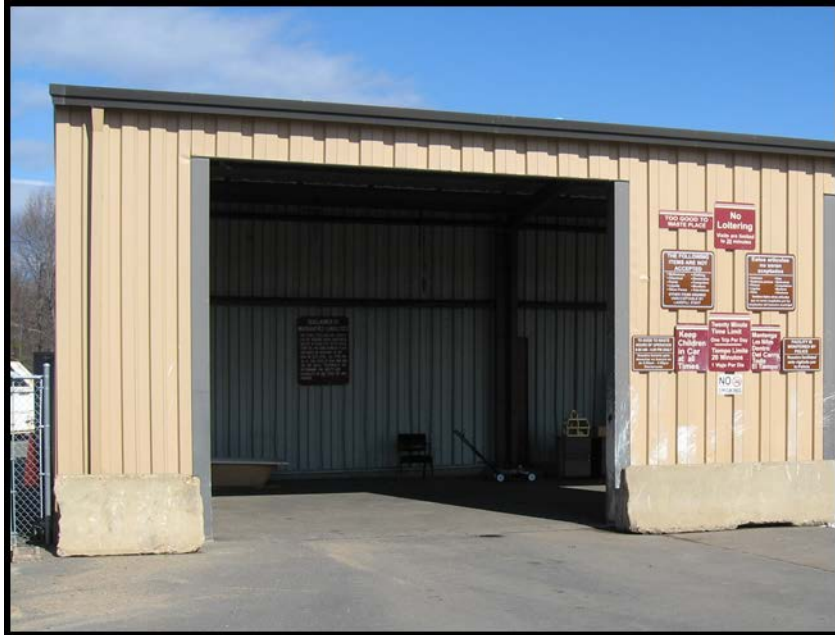
Front view of the Donation Center