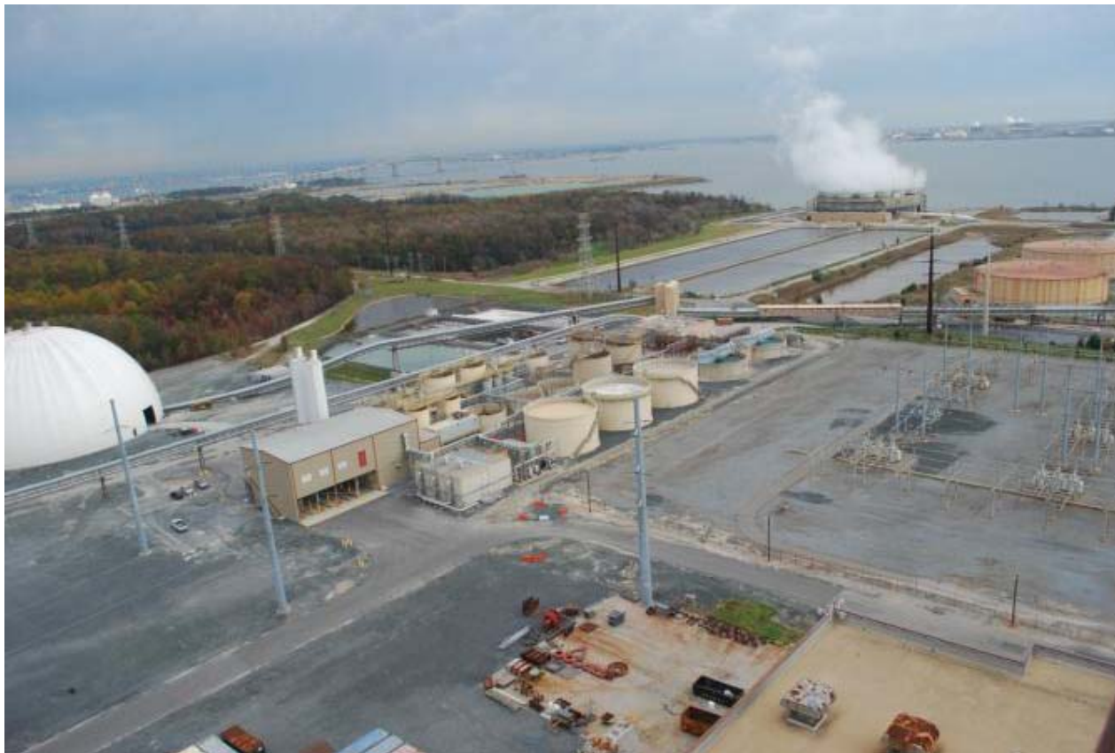
Nearly a billion dollars in pollution control equipment at Brandon Shores power plant

iversity of Massachusetts onomy Research Institute.