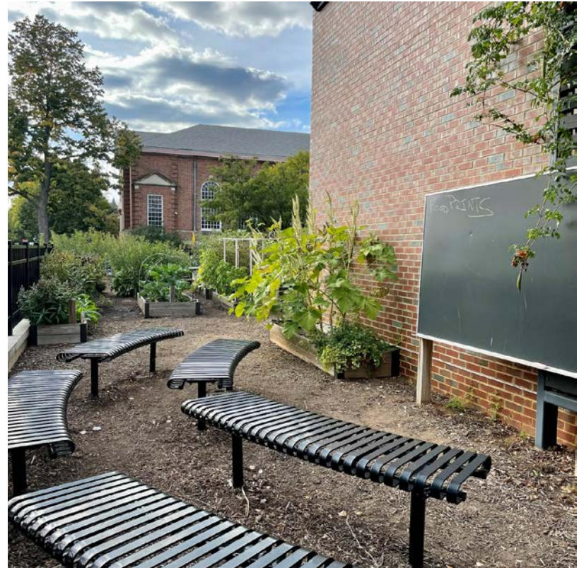
School garden and outdoor classroom at Watkins Elementary School in the District of Columbia, one of several DC Public Schools that participate in FoodPrints.