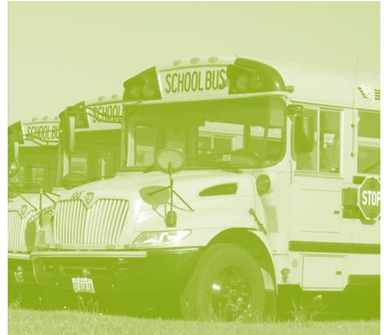
School Buses