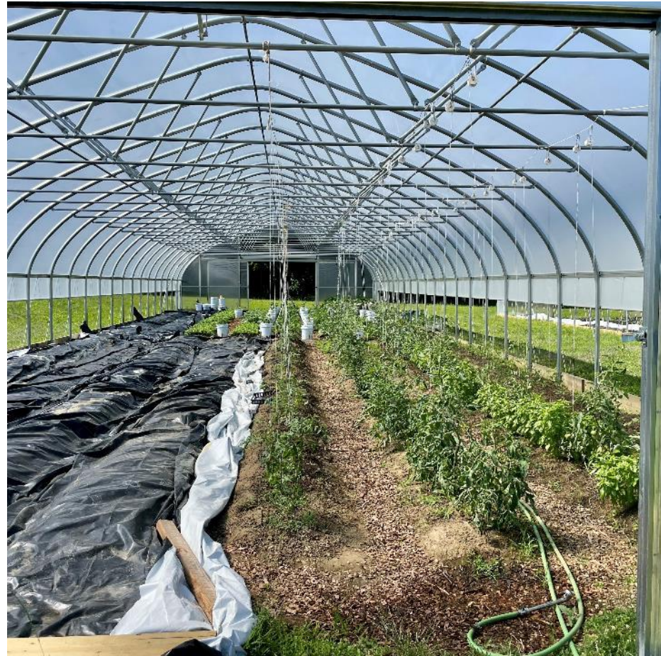
Regional Agricultural Work Group visit to The Urban Farm Incubator in Prince George's County in June. The Urban Farm Incubator is managed by ECO City Farms and is a collaborative partnership of several nonprofits and County agencies.