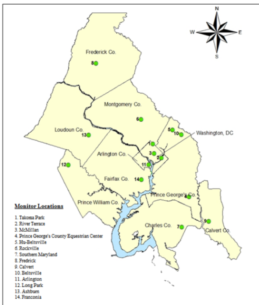
Figure 2-1: Washington DC-MD-VA 2008 Ozone NAAQS Nonattainment Area

As shown in Figure 2-1, the air monitoring network in Washington DC-MD-VA region contains 14 sites that monitor ozone. Federal regulations only mandate four ozone sites for a metropolitan statistical area of greater than 10 million people containing an ozone nonattainment area (40 CFR 58 Appendix D Section 4.1). Therefore, the Washington DC-MD-VA region currently has an exceptionally robust network.