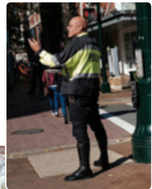
Montgomery County Police Department