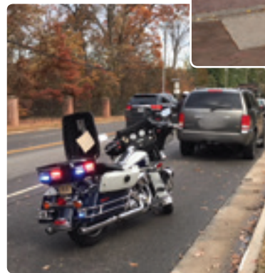
Alexandria Police Department