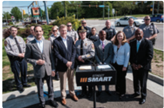
Spring Kickoff Speakers with Law Enforcement