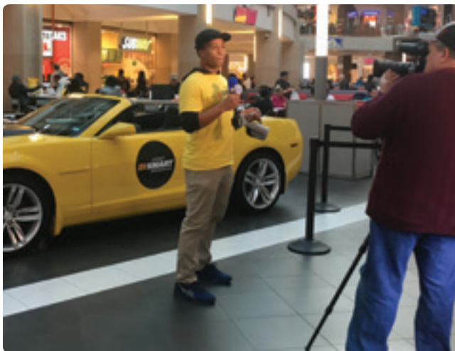
Street Smart Virtual Reality Challenge

In 2018, Street Smart developed an innovative new approach to on-the-ground outreach with the Street Smart Virtual Reality Challenge, an eye-catching and interactive educational exhibit.