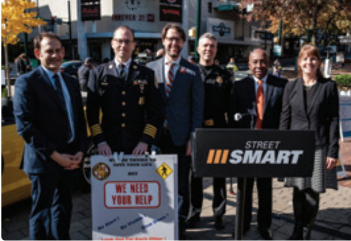
Fall Kickoff Speakers