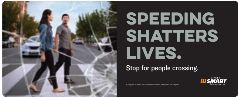
One of four ads presented to measure aided awareness

Without any visual aid, respondents were asked if they recalled seeing Street Smart pedestrian or bicycle safety ads within the past few months. The number of respondents who selected “yes” declined from 19% in 2018 to 13% in 2019.