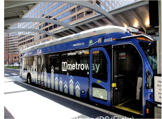
(BeyondDC / Flickr)