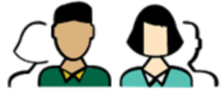
Community Care Coordination