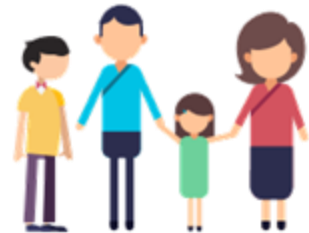
Transitions of Care