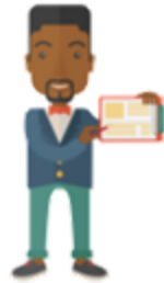
Managed Care Case Management