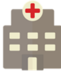
Hospital Readmission Reduction Programs