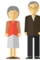
Long-term Services and Supports