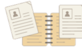
Life Care Planning