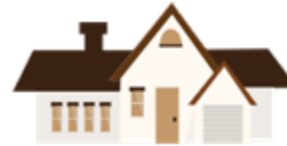
Housing & Supportive Services