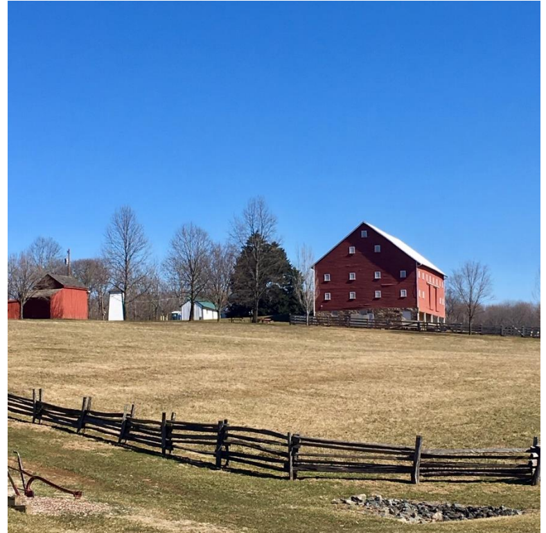
Montgomery County's Agricultural History Farm Park where many of the county's essential farm service agencies are located.