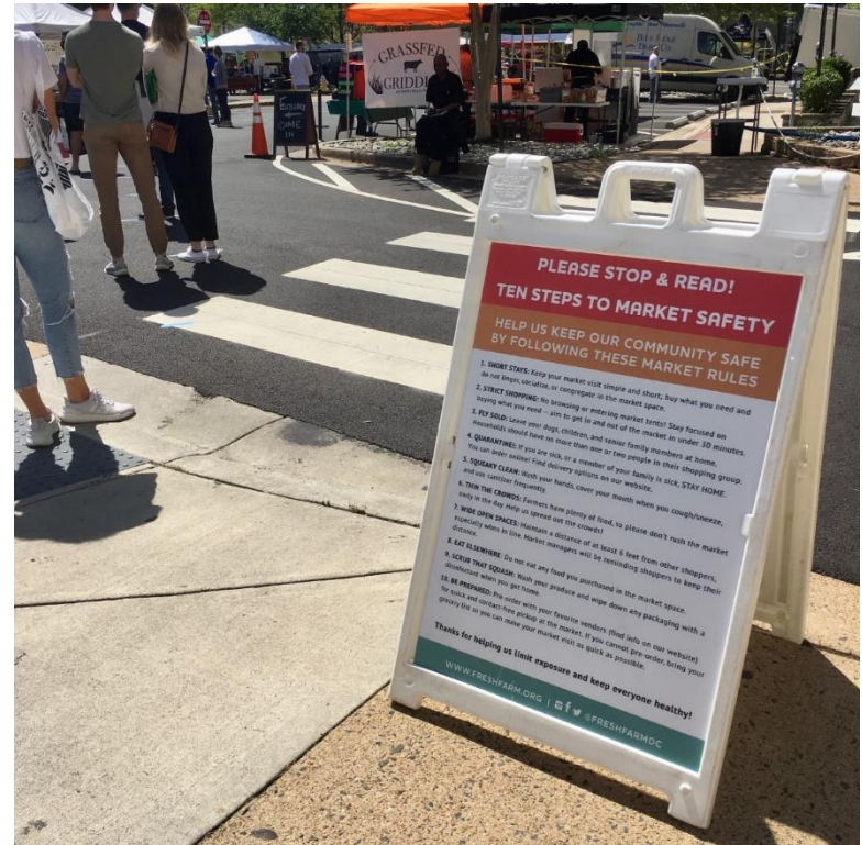
Social distancing at the Arlington County Farmers Market in early May.