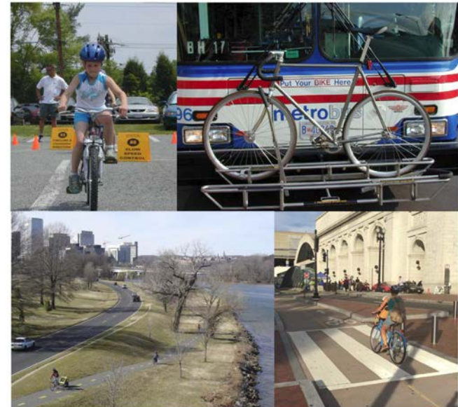
Bicycle and Pedestrian Plan for the National Capital Region