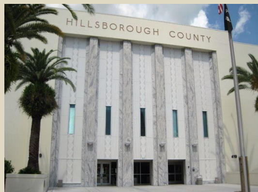
This historic Hillsborough County Main Courthouse was built in 1952. The building is ENERGY STAR certified and is connected to the chilled water piping network in downtown Tampa.

In order to promote greater awareness of the success that Hillsborough County has experienced in achieving greater energy efficiency, the county entered nine of its buildings into the 2013 ENERGY STAR National Building Competition: Battle of the Buildings , including eight office buildings and a courthouse.