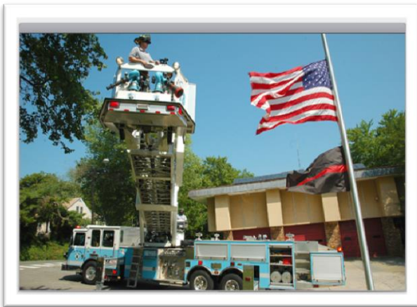
The Chief's Energy Challenge invites fire stations nation-wide to reduce their energy usage.

In addition, the Chief's Energy Challenge was created by the Town of Cary in conjunction with Chapel Hill, Durham, and Raleigh, NC. The Challenge is an intensive program that uses Portfolio Manager to track its results. Each fire station was challenged to reduce its energy usage by 10 percent in the first year and 20 percent by the third year. Cary's in-house station-to-station challenge took place in 2011–2012. The Challenge contributed to Cary's success in the 2012 Battle of the Buildings, which is unique because a town led initiative lent itself to a larger competition. Portfolio Manager enabled Cary to track the different aspects of the fire station's energy usage as they changed throughout the challenge and created a common platform for stations to track and compare their energy usage in comparison to other stations.