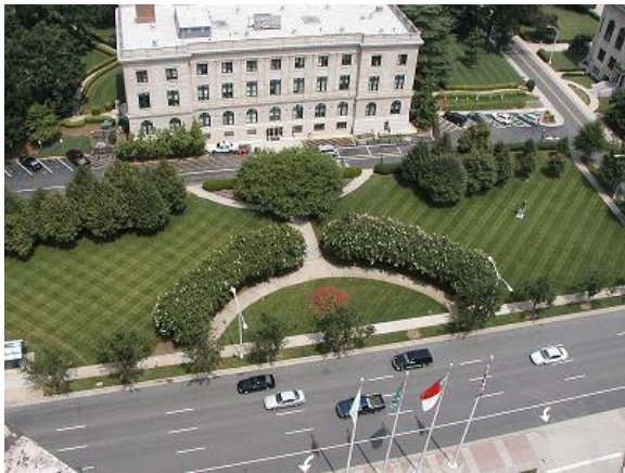
City of Charlotte's Old City Hall

The City of Charlotte (pop. 735,780) is a local government that decided to take up the challenge. 3 The city has long been an advocate of ENERGY STAR and Portfolio Manager™. The local public school system had great success with the 2012 ENERGY STAR National Building Competition, in which Hickory Grove Elementary School was recognized for reducing energy emissions by more than 20 percent that year. In 2013, the City of Charlotte decided to follow suit. The city selected three buildings to participate in its inaugural year participating in the Battle of the Buildings. Charlotte's Government Center was first ENERGY STAR certified in 2009, making it a natural choice. The second building was the Charlotte Police Department Headquarters, a building slated for upgrades expected to improve energy efficiency sufficiently to earn ENERGY STAR certification in the next several years. But perhaps most surprising is the third building that was selected, Charlotte's Old City Hall.