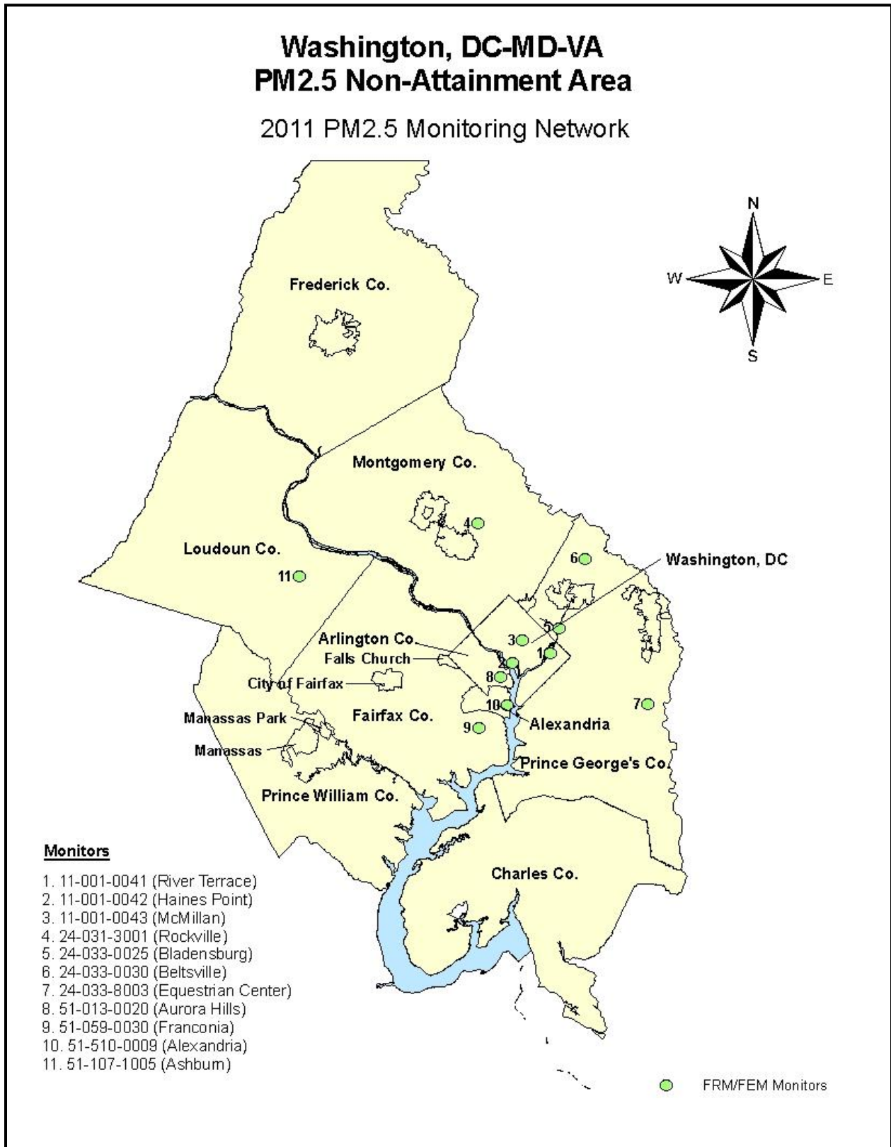
Figure 3-1: Washington DC-MD-VA PM 2.5 Monitoring Sites