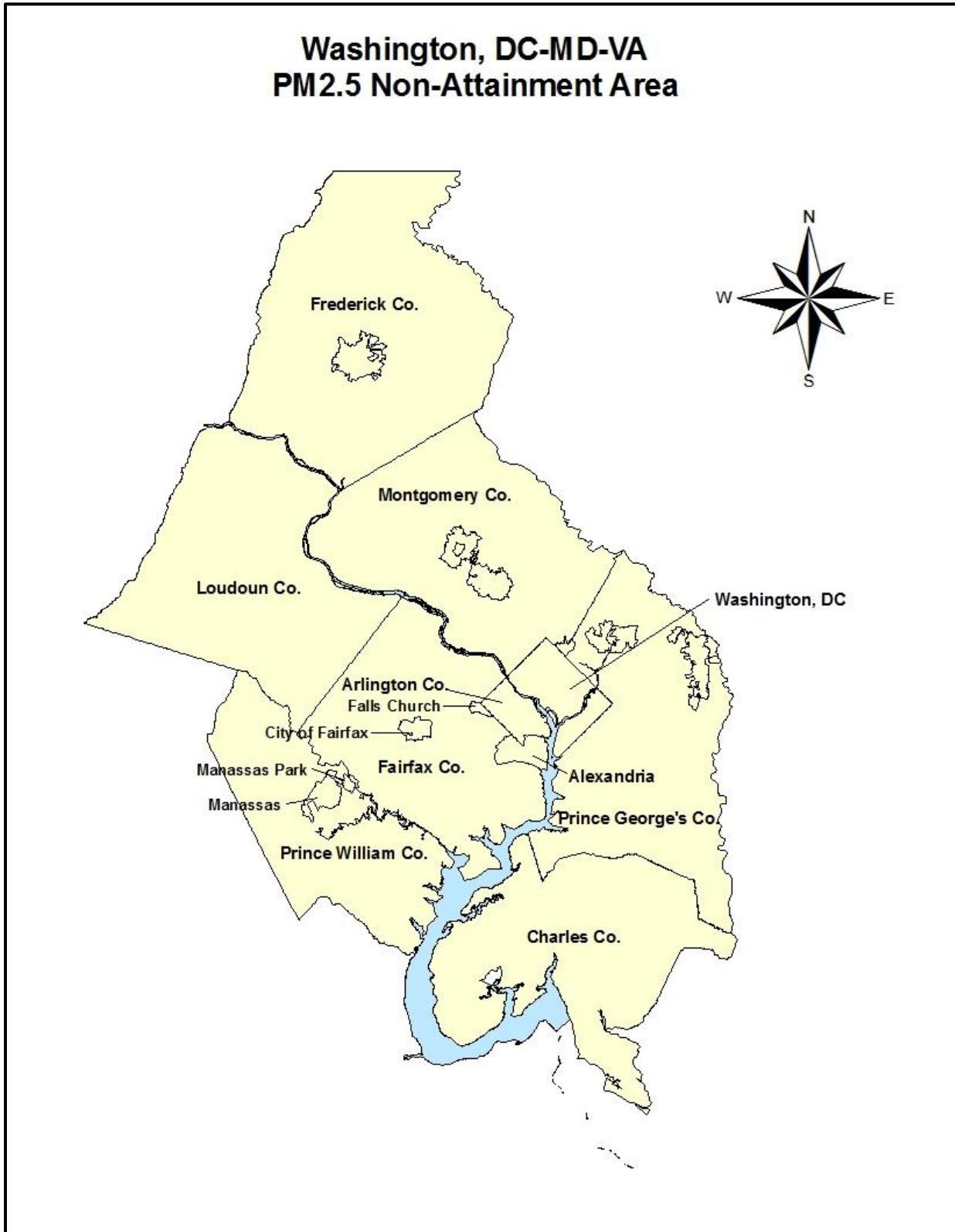
Figure 2-1: Washington DC-MD-VA 1997 PM 2.5 NAAQS Nonattainment Area