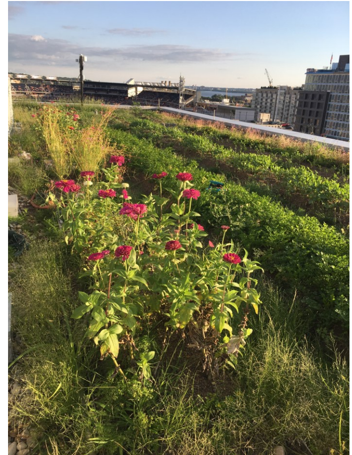
Up Top Acres in Washington, D.C..