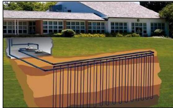
Figure 1: Geothermal Heat Pump Illustration

Metropolitan Washington’s mean ground temperature is 56°F year-round. GHPs use the ground as a “heat source” for heating in the winter; and as a “heat sink” for cooling in the summer. GHPs move fluids through continuous pipeline loops that are buried underground and deliver conditioned air through heat pump equipment serving the various parts of the building. GHPs are a common technology used in metropolitan Washington.