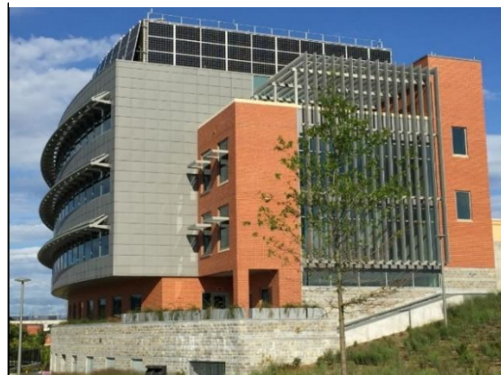
Figure 2: Alexandria Renew Enterprises

If it is not financially feasible to implement solar at the initial development of the new high school, it is recommended that the RFP for a new high school specify that the school is developed as “solar ready” so that solar can be later installed on the roof and awnings. The City may also want to explore use of any solar Power Purchase Agreement (PPAs) utilized in neighboring jurisdictions.