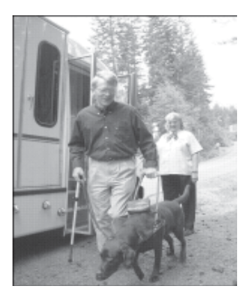
Demand-responsive services, also called paratransit, are required by the Americans with Disabilities Act.

WMATA formed the MetroAccess Ad Hoc Advisory Committee in February in response to public criticism about service lapses following a change in paratransit contractors. The TPB Access for All