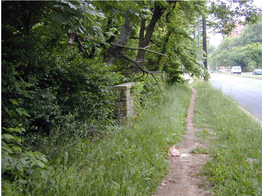
Figure 1: Informal foot path

The Washington region has excellent long-distance separated facilities for bicyclists and pedestrians, and an urban core and certain regional activity centers that have good pedestrian and bicycle facilities. On the other hand, many activity centers, not originally designed with pedestrians in mind, have grown dense enough to generate significant