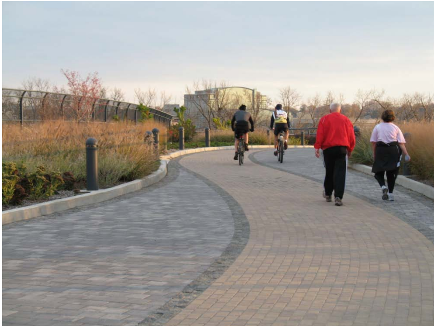
Figure 7: Woodrow Wilson Bridge Trail

This new multi-use path allows riders on the Mt. Vernon Trail to access the National Harborplace development in Prince George's County without going on street. Connections are also provided an on-street network of bicycle routes in Prince George's County.