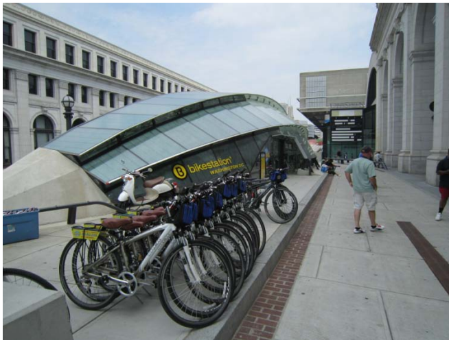
Figure 8: DC Bike Station at Union Station