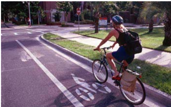
Figure 4: Bicycle Lane

Bicycle lanes are marked lanes in the public right-of-way that are by law exclusively or preferentially for use by bicyclists. Bike lanes are one-way, with a bicycle symbol or arrow indicating the correct direction of travel. The minimum width next to a curb is 4 feet for roadways with no curb or gutter, next to a curb or parked cars 5 feet. Bike lanes are provided on both sides of the street, except for one-way streets, and allow travel only