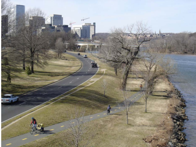
Figure 2: Mount Vernon Trail

The Washington region is renowned for the quality and extent of its major shared-use paths. Shared-use paths are typically located in their own right-of-way, such as a canal, railway, or stream valley, or in the right-of-way of a limited-access highway or parkway, such as the George Washington Memorial Parkway. Shared-use paths are eight to twelve feet in width. The region has approximately 200 miles of major shared-use paths, either paved or level packed gravel surface suitable for road