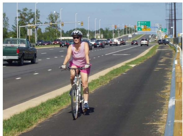
Figure 3: Side Path on Fairfax County Parkway

Side-paths differ from shared-use paths in that they do not have their own right of way, but are closely adjacent to a non-limited access roadway and thus subject to more frequent conflict