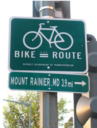
Figure 6: DC Bike Route Sign

The region has hundreds of miles of signed bicycle routes. Signed routes have the advantage of being inexpensive and informative for cyclists. A signed route has not necessarily had any bicycle-related improvements apart from signing. However, bicycle-friendly features such as paved shoulders, a wide curb lane, or low traffic volumes or speeds may be present. The trend with bicycle route signs is to include information on distances to destinations.