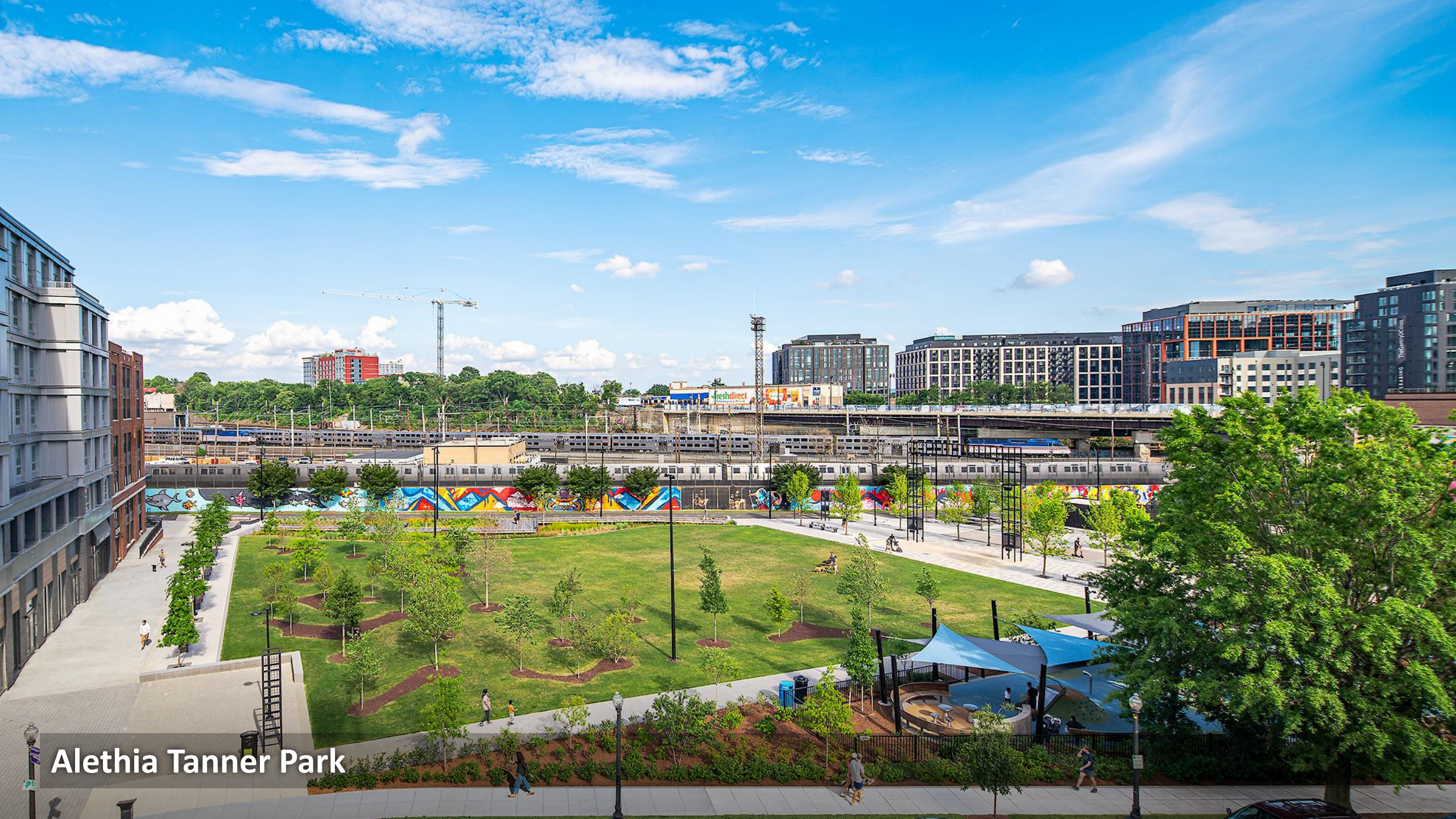
Alethia Tanner Park