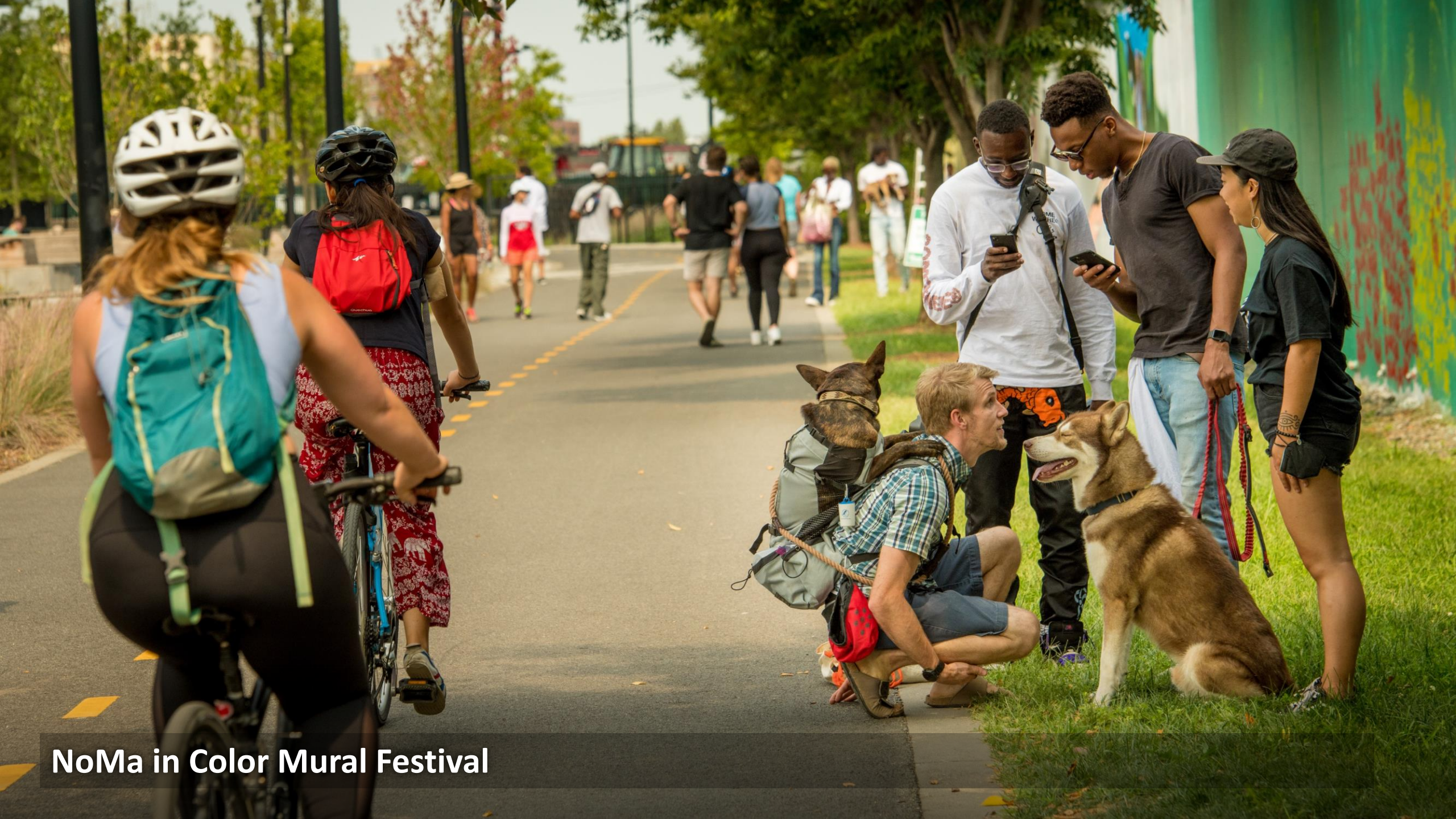
NoMa in Color Mural Festival