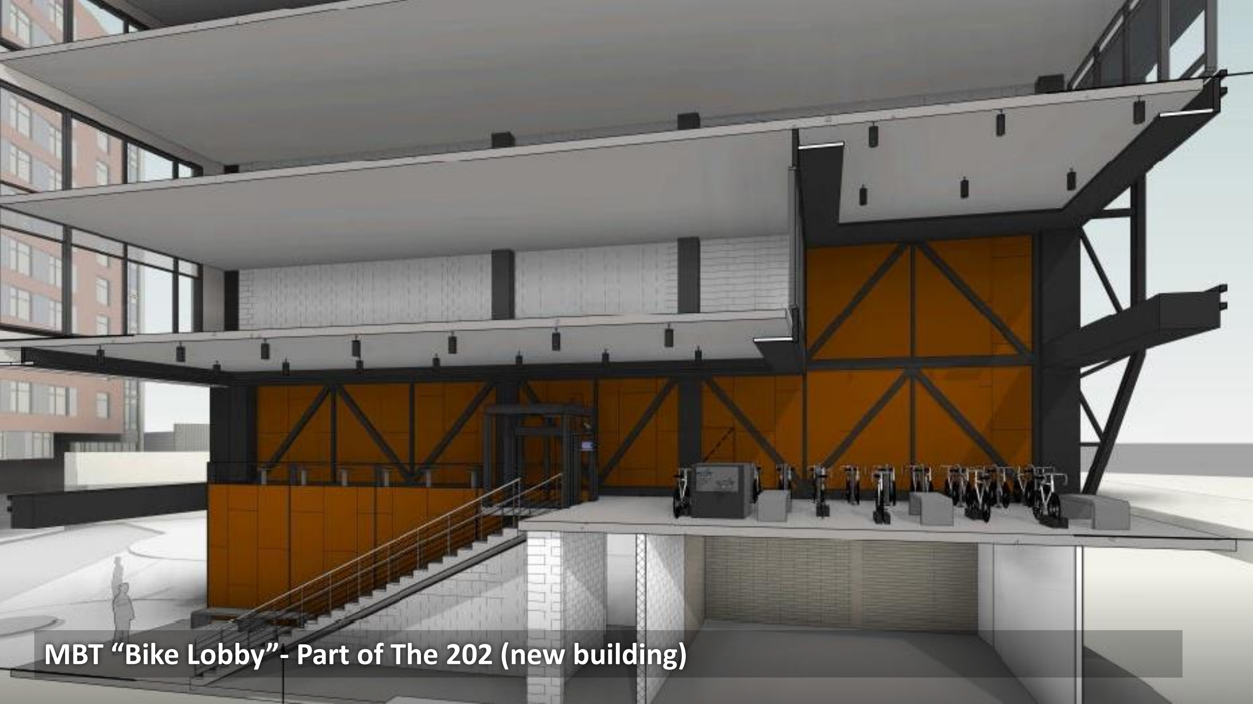
MBT "Bike Lobby" - Part of The 202 (new building)