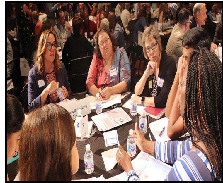
Community Conversation at the Silver Spring Civic Center, Spring 2018