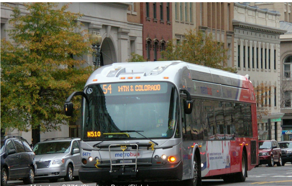
Metrobus 6771

The D.C. Silver Jackets, a group that works to address flooding in the area, held a flood summit in September. The event spotlighted the region’s vulnerability to flooding from the Potomac River, storm surge, stormwater runoff, and water infrastructure failures. COG’s environment staff attended and presented a poster (produced with National Park Service support).